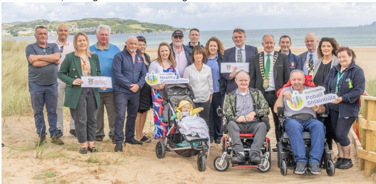
Opening of Magherawarden beach boardwalk and launch of accessibility equipment.

wheelchairs and Age-Friendly mobility walkers ensures that individuals with mobility challenges can fully participate in beach activities. The initiative also includes provision of 'Changing Place' facilities at select beach locations, catering for individuals with higher level of need.