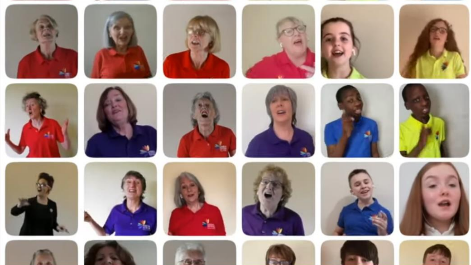
Here Comes the Sun Ceol Le Cheile

In May 2020, the choir recorded 'Three Little Birds' as part of the Bealtine Festival for 2020. It was so successful, achieving almost 10,000 YouTube views, that Age & Opportunity invited Ceol le Chéile to record a video for the Bealtine Festival, in 2021. 'Here Comes The Sun', by Beatles member, George Harrison, was selected. The purpose behind this song choice, was the uplifting lyrics which complimented the sense of hope around the world, as countries near the end of the Covid pandemic nightmare.